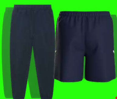
PLAIN NAVY/BLACK JOGGERS/SHORTS ASDA, PRIMARK, TESCO, ETC.