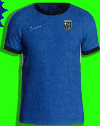
LOGOED SHIRT £22.36 MANDATORY