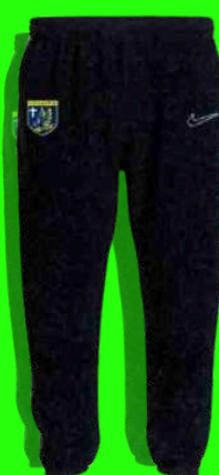
LOGOED JOGGERS £35.96 OPTIONAL