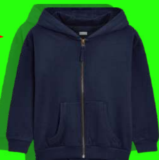
PLAIN NAVY/BLACK HOODIE ASDA/PRIMARK/TESCO, ETC...