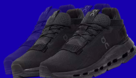
TRAINERS AND WELLIES (OF YOUR CHOICE)