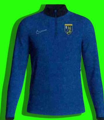
LOGOED QUARTER ZIP £35.99 MANDATORY