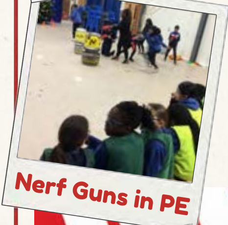
Nerf Guns in PE