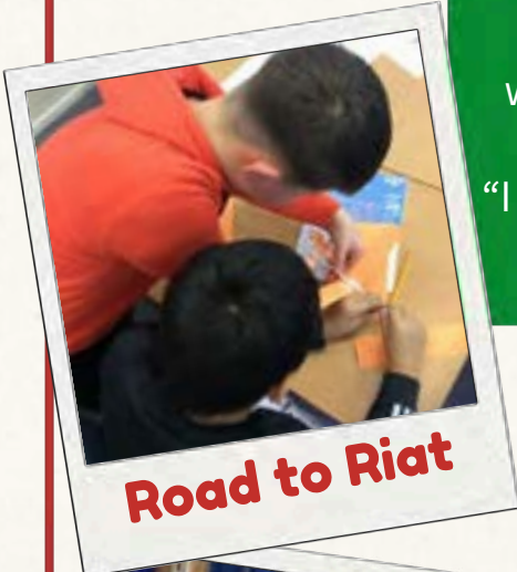
Road to Riat